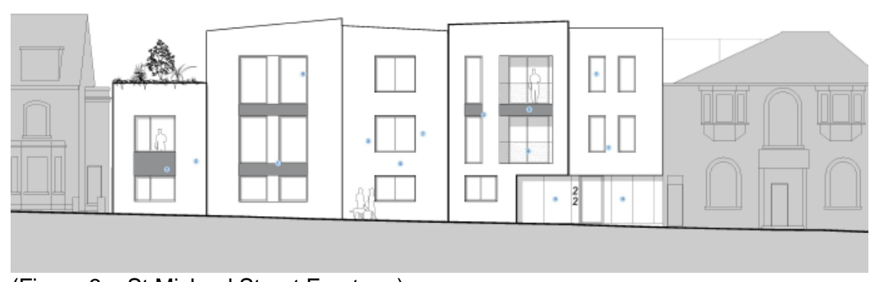
(Figure 3 – St Michael Street Frontage)

3.2 The scheme has been amended during the process of the application and has been reduced from 50 to 45 flats and reduced from 6-storeys to 5-storeys fronting Tontine Street. The apartments would consist of 8 x studios, 31 x 1 beds and 6 x 2 beds