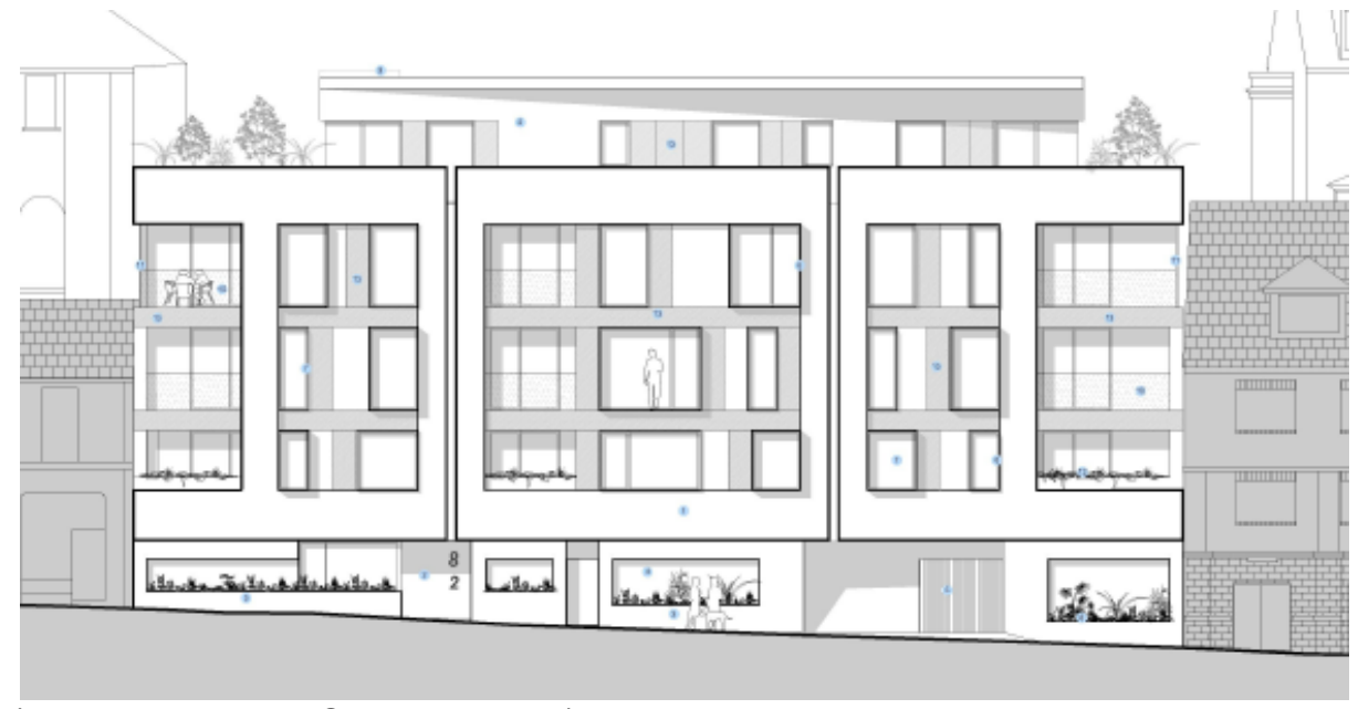
(Figure 2 – Tontine Street Frontage)

3.1 Full planning permission is sought for the erection of a part 5-storey and part 3-storey building comprising 45 apartments with associated access, parking and communal garden. The development would have a dual aspect and would be up to 5-storeys fronting Tontine Street (Fig.2) and up to 3-storeys fronting St Michael's Street (Fig.3). A landscaped courtyard is proposed to the first floor and a raised podium garden is proposed which would have seating and raised planters with trees.